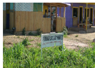
New Market Place in Frank's Eddy Village

attracting more people to drive through the area. For many years this main drag has brought visitors to the nearby adventure centers off the Caves Branch river which provides for the country's best tubing, caving, hiking, and zip-line activities. Now a stop along the way can provide for gifts, produce, a quick meal, and even a haircut.