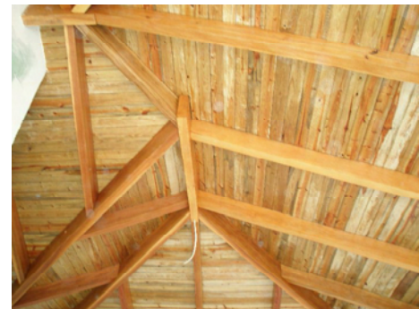
Open beam ceilings in the living room