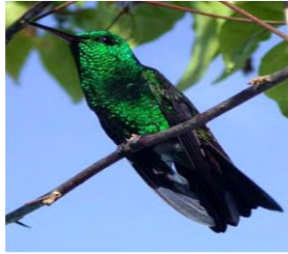
A Copper-rumped Hummingbird

The Caribbean Islands and countries have a reputation for fabulous wild interiors that are great to explore some of the most magnificent birds of the world. On foot with a trained guide through a rain forest offers the perfect environment to observe the natural flora, fauna and tropical birds on a bird-watching holiday. Hiking and bird-watching is eco-tourism at its best as