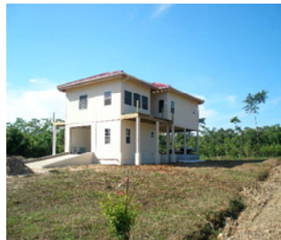
Front right corner view