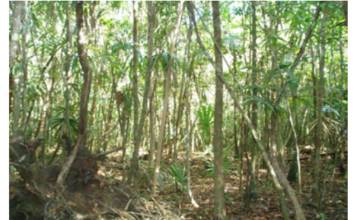
Lots of trees and shade on Phase 2 parcels