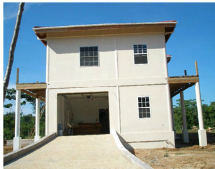
Garage Opening Right Side