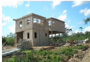
Front right corner view