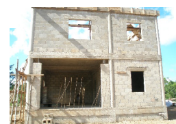
Garage Opening Right Side