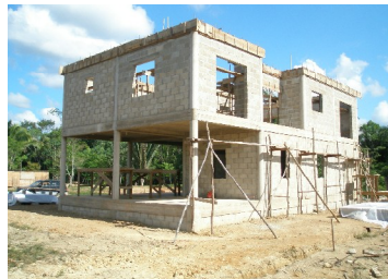
Back left corner view