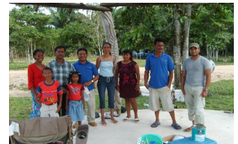
Member's of Marla's Kids House of Hope and Camino Del Rio

soring businesses providing a scholarship and school supply support to one of the residents. Most of the youth reside at this home until they are adopted via foster care or circumstances change that allow them to return home to their families.