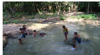
Kids takes a splash in the Maya Creek at Camino Del Rio

This group home is one of three in the district that not only provides a home but also offers educational scholarships to sponsor the children attend government schools and for books and supplies. The pro-