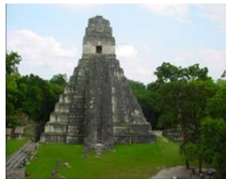
Take a cultural visit to Tikal in Guatemala

ecotourism enterprises. Another aspect of ecotourism is the practice by providers of efficient use of nonrenewable resources with low environmental impacts.