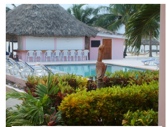
Enjoy a poolside dip with views of the Caribbean Sea

cayes, and a variety of excursions can all be arranged through the front office. Guests can also enjoy free use of the library, bicycles, and volleyball court. The hotel runs a shuttle to and from the center of town daily.