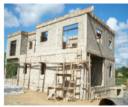
Back right corner view