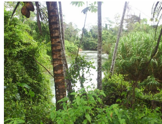
Conservation of the eco-system at Camino Del Rio in Belize

An integral part of Ecotourism is the creation of economic opportunities for local economies by providing jobs to local populations. This allows for the sharing of the socio-economic benefits of the tourism industry with the local communities and indigenous people by having their informed consent and participation in the management of